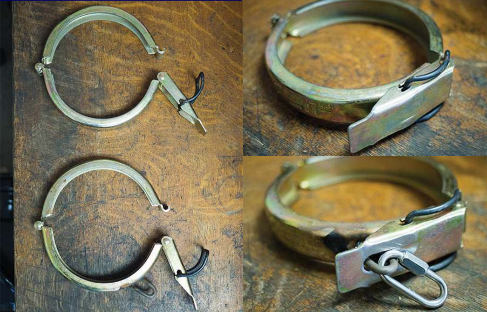
Left: Regular and Locking Clamps.

We offer two varieties of clamps: a regular eccentric clamp and a modified locking eccentric clamp. Locking eccentric clamps are designed to be used in the water with our floating discharge package.