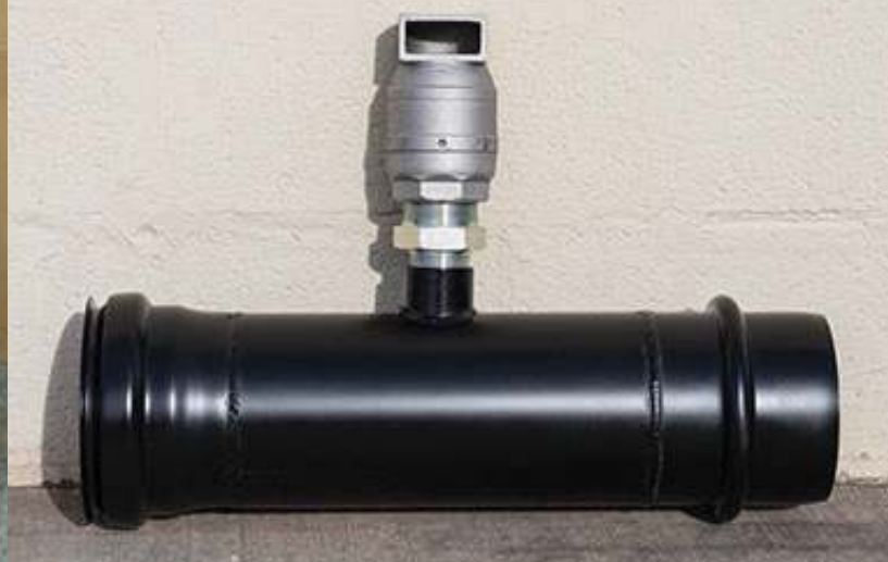
Left: Manifold Kit. Top Right: Inspection Port. Right: Vent Check.

We offer a variety of discharge pipeline components. Our Manifold Kit allows you to pump into two GeoTubes, each additional GeoTube requires more discharge components.